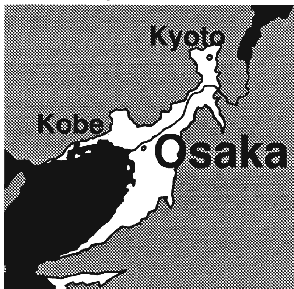
Fig. 1. Location of Osaka

For a numerical simulation of an urban thermal environment, one of the authors undertook a field survey (Yoshida et.al.,1991). But still little is known about the thermal influence of green canopies of differing scales. The aim of this present field study is to collect fundamental data to propose this “Cool Spot” as a unit to be considered in urban environmental planning. Some sets of meteorological measurements were carried out of differing scale urban parks in Osaka in August 1992, to determine the thermal effect of green canopies and the relation between the scale of the green canopy and its thermal effect.