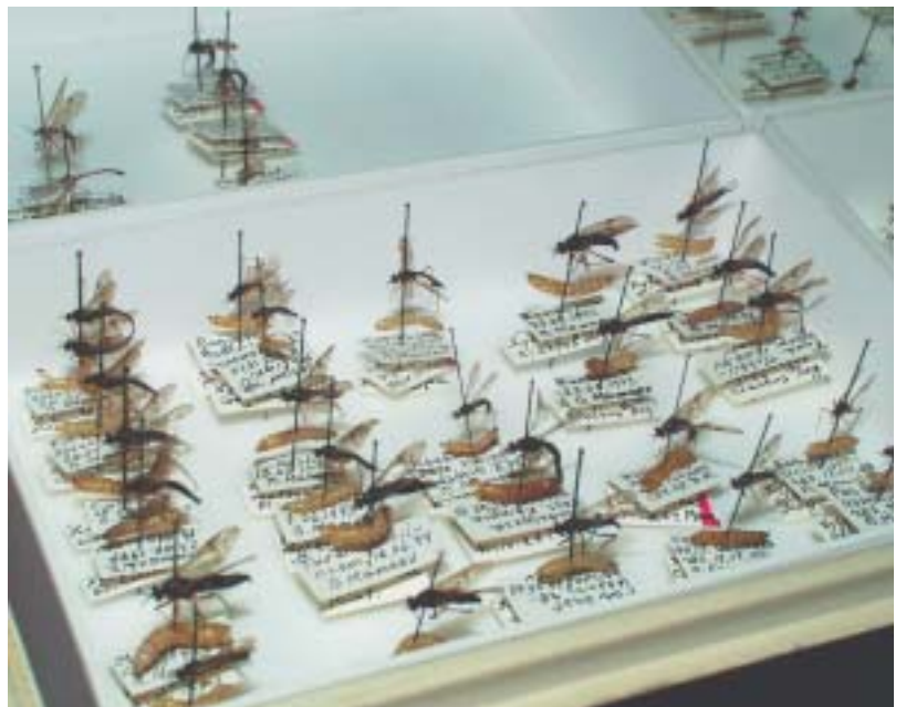
Fig. 3 針刺し標本 (双翅目) Pinned specimens of Diptera