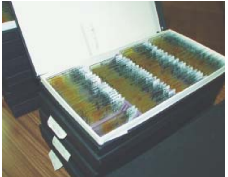
Fig. 1 収納された永久プレパラート標本 Slides in preparation box