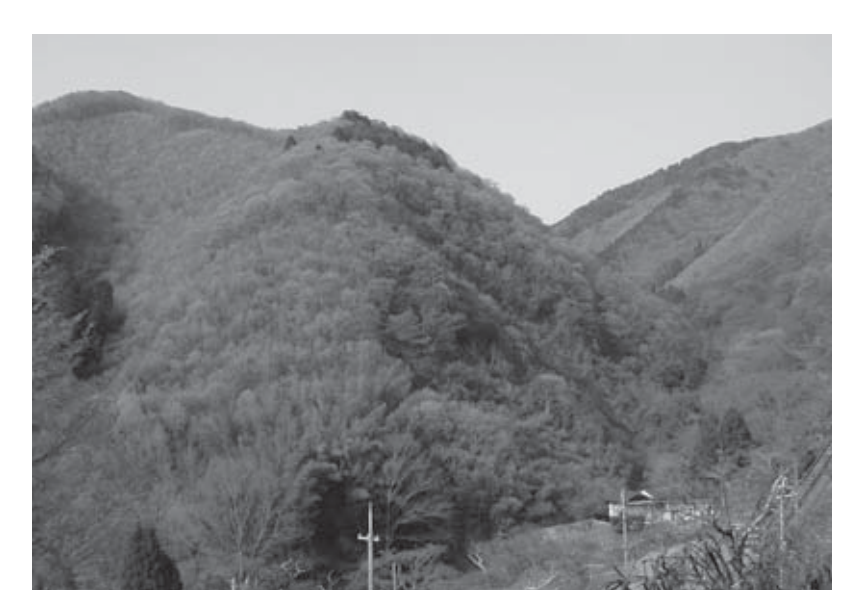
Figure 4. Typical landscape of Satoyama with shifting cut down of trees, Kurokawa, Hyogo Prefecture; various ages of forests are seen in belt showing shifting cut down of trees for charcoal production.