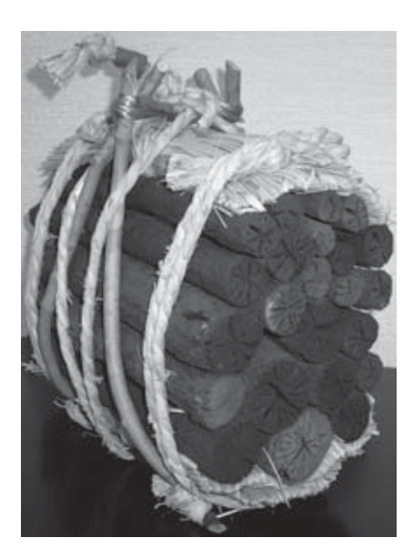
Figure 5. Kikuzumi; best kind of charcoal for tea ceremony.

existence of various plant species is now threatened by their overgrazing. In a wide range of agricultural areas, crops and vegetables cultivated there are attacked by deer, and attempts by farmers to protect them by netting and other barriers have little effect. Control of the deer population is urgently needed, but no successful method has yet been developed. Hunters are promptly decreasing in number and their mean age is increasing, and deer meat is not very highly appreciated in Japan. One hopes that a better method of cooking of deer meat can be developed, so that more deer can be shot by hunters.