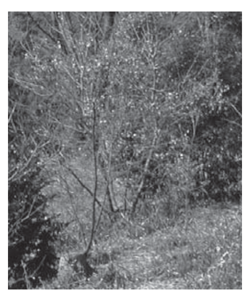
Figure 3. Basal tree-trunk with new trees growing, in Satoyama secondary forest after cutting down about 1 m high: Prunus jamazakura in Machida, Tokyo.

was formed naturally during its long history, and it was not the design of any particular person. Life in the Satoyama zone is more or less different in each particular site, and the vegetation is also variable. After the 1960s, most of the Satoyama forests were abandoned and rarely maintained; most of these forests at the moment are better called devastated forests after Satoyama. This makes the definition of Satoyama much more difficult.