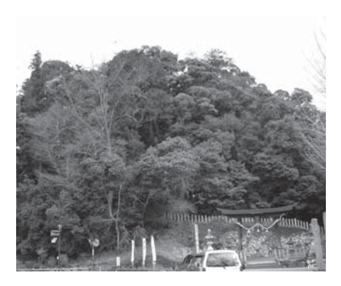
Figure 7. Chinjyu-no-mori, from Tamba, Hyogo Prefecture; seemingly primitive forest is kept covering the shrine even in midtown in my hometown.

Worldwide it is not very common to invite 'gods' to the villages and pray to them to protect the people there. In primitive forms of religion, people usually believe in their own 'gods' and decidedly reject those of others. I will not discuss here the development of religions in general, as this is not the subject of this paper. I would like to point out the fact that it is a distinctly Japanese phenomenon for all the village-shrines, or 'uji-gami', to be surrounded by forests. We call this type of forest 'chinju-nomori'. Literally, 'chinju-no-mori' originally meant a grove of a tutelary shrine quietly protecting the 'ujigami' and accordingly, the village people. Miyawaki (2007) referred to it in discussing the potential natural vegetation at the sites concerned, and put importance on its protection. I understand that this particular Japanese term, 'chinju-no-mori', is often used in the field of vegetation science and is now more or less