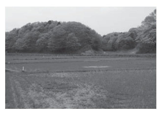
Figure 1. Landscape of Hitozato, Jike, Yokohama city; backyard of cultivated fields is covered by the secondary forest.

The Japanese Archipelago were originally covered