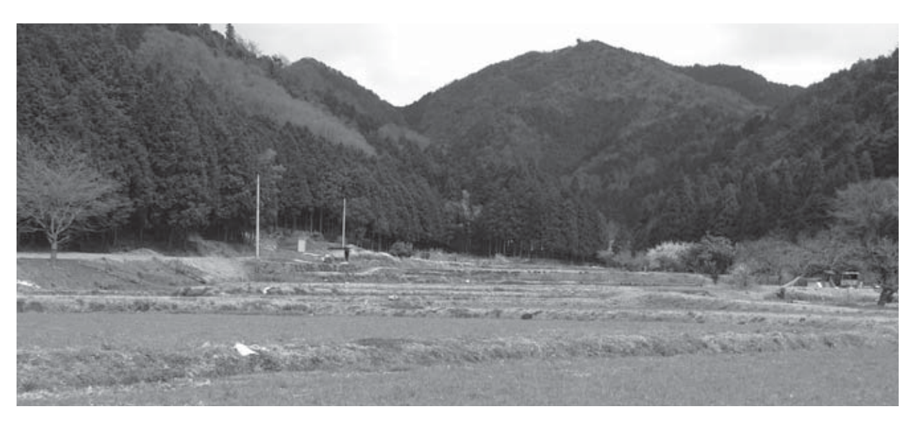
Figure 6. Satoyama, Tamba, Hyogo Prefecture; secondary forests are abandoned, and Cryptomeria trees are planted in wide area without effective utilization.

area, and the only product is wood for charcoal. Volunteer collaborators are taking care of the forests there, and such a collaboration is necessary if the Satoyama landscape is to maintain its original style.