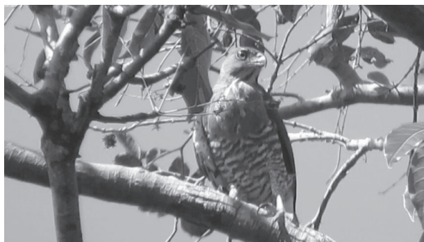
Figure 2. A crested goshawk ( Accipiter trivirgatus ) perching near the feeding site of the Javan lutungs.

The PNR is located at 108° 40' E and 7° 43' S on the southern coast of West Java, Indonesia, on a small peninsula approximately 3 km long and 2 km wide (see Sumardja and Kartawinata, 1977; Brotoisworo, 1991; Mitani et al., 2009). The elevation of this peninsula is within the range 0-150 m a.s.l., and its average height is approximately 100 m. The average annual rainfall from 1990 to 2010 is 2,940 mm, although there is some inter-annual variation (Rosleine and Suzuki, 2012). Air temperature and humidity were 22.5-35°C and 88.5-96.5%, respectively (Kool, 1993). The nature reserve is located at the peninsula, bordering the remainder of the island through an isthmus approximately 200-m wide, linking the peninsula to the mainland. The reserve is divided into two zones: a public-use zone (nature recreation park) of 38 ha, and the nature reserve, which consists of 370 ha and includes the remaining area (Mitani et al., 2009). A 5-m-wide paved forest path runs through the recreation park for visitors' convenience. Inside the recreation park, there were six groups (123 animals) of Javan lutungs in December 2013 (Tsuji, unpublished data). Studies on their ecology have been conducted since the 1980s (Brotoisworo, 1991; Kool, 1993; Mitani et al., 2009). Since 2010 we have followed three out of six groups (K, P, and J group), and group composition, diet, and ranging behavior have been studied (see Tsuji et al., 2013).