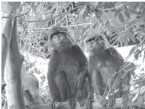
Figure 1. Javan lutungs ( Trachypithecus auratus ) sitting on a branch.

predation by the goshawks. Such observations will further our understanding of the predatory pressure posed by avian predators on Asian colobines.